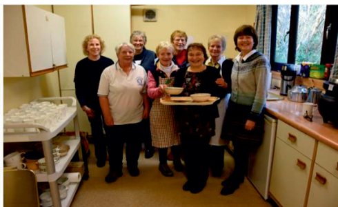
Helpers in the kitchen some of whom have been volunteers for 13 years.

We are grateful to the Friends of Dr Graham's Homes on the island of Arran, who arrange an annual "Soup and Sandwiches" get-together.