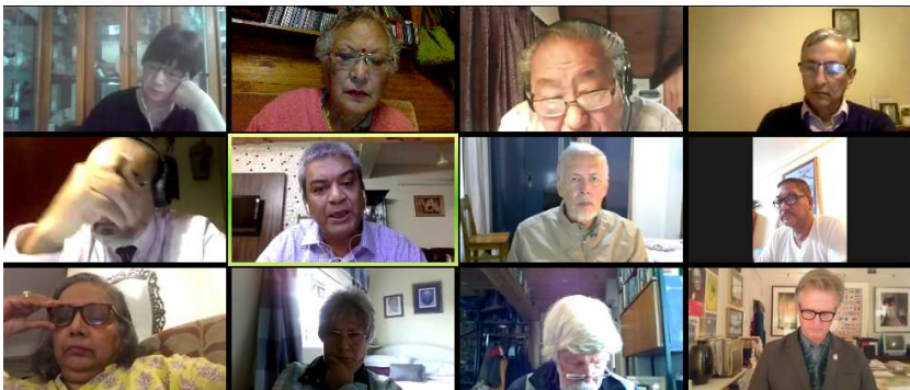
Board of Management Zoom meeting