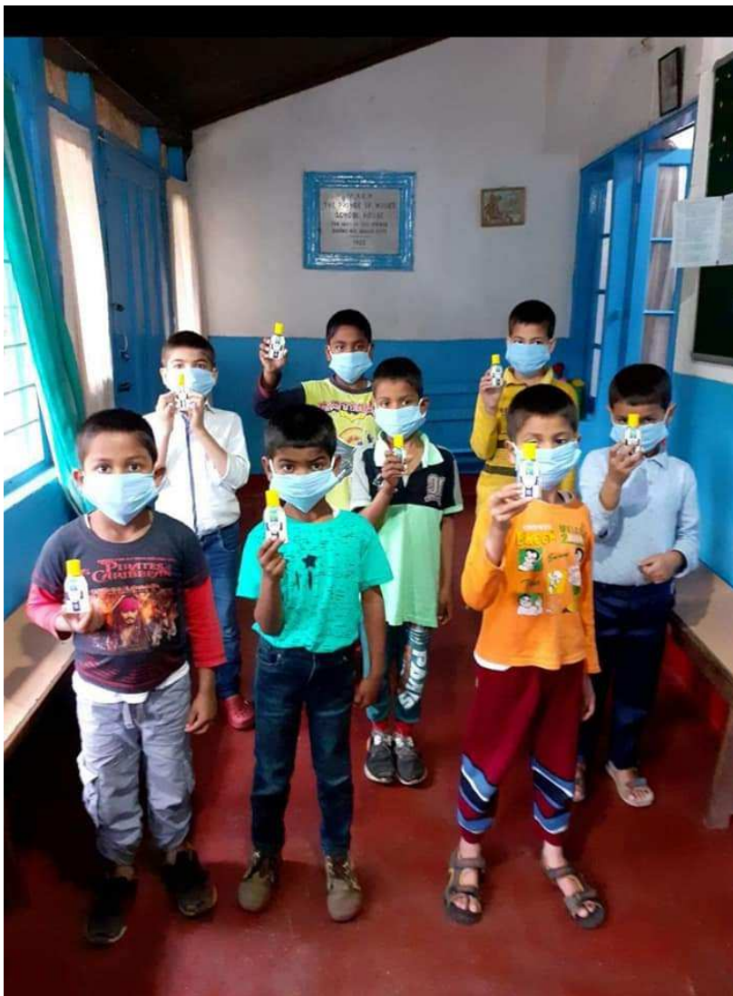
The new reality