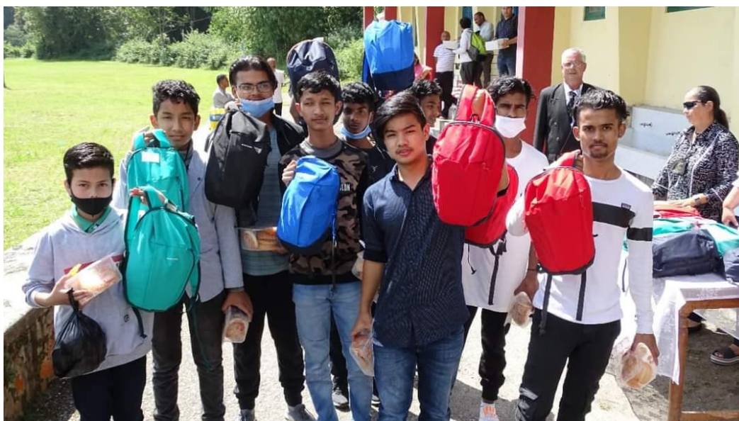
Some of the boys at DGH in September 2021

What our students have to say ... In our role as Sponsorship Secretaries, we have had the privilege of hearing the voices of the children through many of the letters and emails sent by them to their sponsors. We are also in direct correspondence with all our 31 extended sponsorship students, and we asked some of them to write something for this Newsletter so that you could hear their voices too. They all have so much to say that is positive about the education and care they have received from Dr Graham's Homes and about the support given them by DGHUK. They have also written about their experiences as college students – particularly during this difficult time of Covid. Throughout this Newsletter you will read some of their articles, as well as excerpts from letters they wrote to us before they graduated.