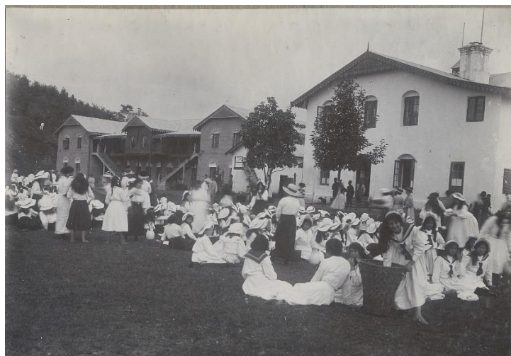
St Andrews' Colonial Homes Birthday Party – 24 th September 1921

Celebrated Annually, World-Wide, No Matter What, No Matter Where! Bring On Those “Buns and Jalebies”!