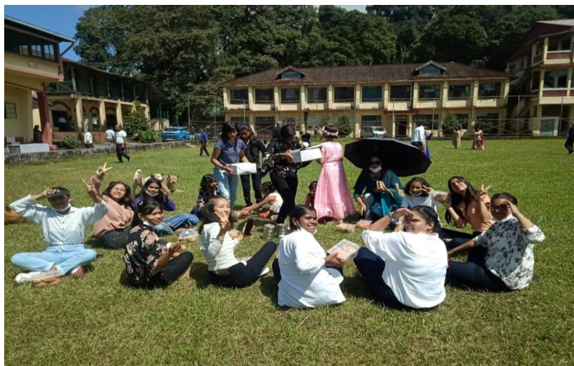
Dr Graham's Homes Birthday Party – 24 th September 2021

Pandemics May Try To Dampen That Homes' Spirit, But “Homes' Birthday” Will Always Be Celebrated!