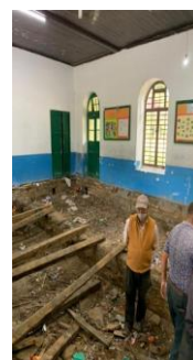
..... via this ...

with time constraints, it was concluded that refurbishment of the Junior School Block be designated as Phase 1 of the entire project. As a Phase 1/Part 1 stage of the works, the completion of a model classroom – Room 1, currently accommodating Class 6A - in time for Homes' Birthday celebrations, 24 th September 2021, was set. The scope of