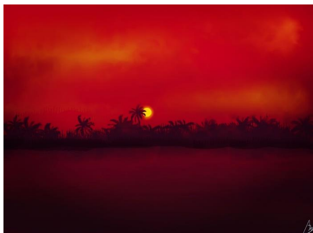
Arannya – Digital Sunset!

The foundation of a language is the most important part of learning a language. I wanted to make French easy to be taught in schools. So, I am preparing a course which specialises in teaching the foundation of French with an aim to prepare students of classes 7-10 for DELF