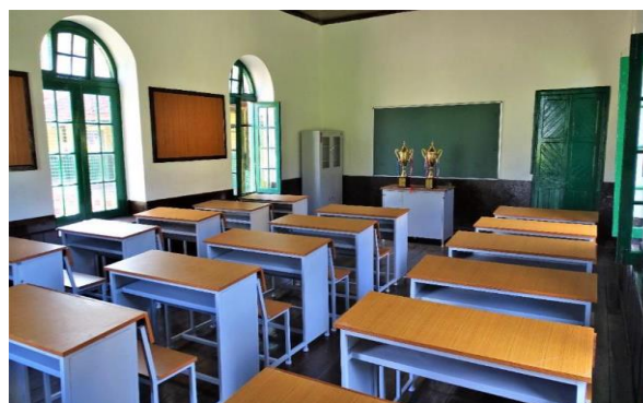
..... to Class 6A's new home!

GO is very conscious of the enormous input of funding, of professional and of voluntary effort given by so many Homes supporters across the world and is most appreciative of that support. Fuller details of all aspects of the “Adopt a Classroom” Project can be found in GO's own Newsletter via www.dghogbs.com