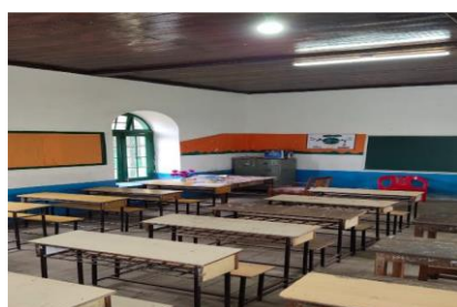
Classroom 1 – from this ...

With the full backing of the Board of Management, a feasibility study providing an assessment of the scope and budget costs had been undertaken by local professionals associated with GO. Taking account of available resources, materials, and workforce requirements, together